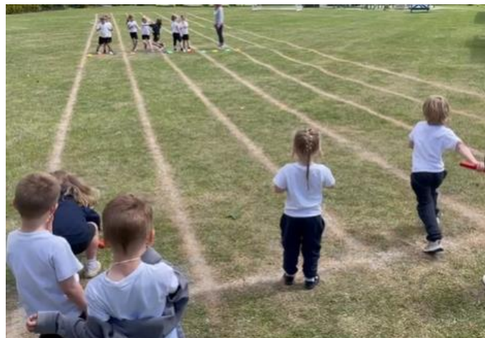
Outdoor PE on the field

We use lots of different apparatus in PE and play lots of games. We use fun things like balls, quoits, hoops and beanbags to learn to throw and catch. We even enjoy a bit of yoga and Zumba!