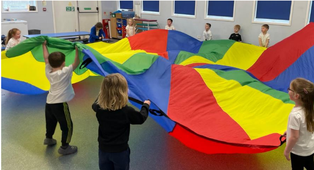
Indoor PE in the hall

If the weather is nice we go outside for PE. We also do PE in the hall. Please send your child to school in their PE kit on our PE day. Thank you.