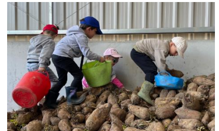
This is our classroom during one of our busy days!